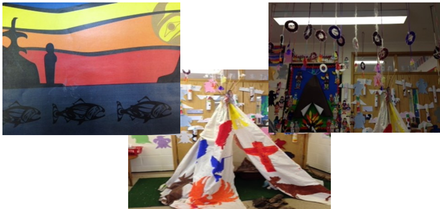
A very busy term!

Our topic on Native America has really captured the children's interest and I hope they have been sharing with you all we have been learning. As well as finding out new information, the children have created some wonderful art work. Our favourite part is having a real size tepee in our classroom and dream catchers which have captured a Native American environment which has engaged the children into learning.